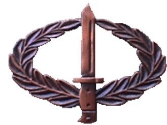
Infantry Combat Badge