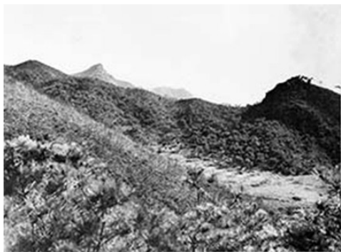
Maryang San (Hill 317) is the steep hill in the left far distance. This photograph was taken from UN lines prior to the assault on the hill. In October 1951 the hill was captured by 3rd Battalion, Royal Australian Regiment during Operation Commando.

The battle was not yet won as 'the Hinge' and Hill 217 remained in Chinese hands. Believing 3RAR required support to take the whole hill, the divisional commander sent the Royal Northumberland Fusiliers (RNF) to aid 3RAR. This battalion attacked but failed to take Hill 217.