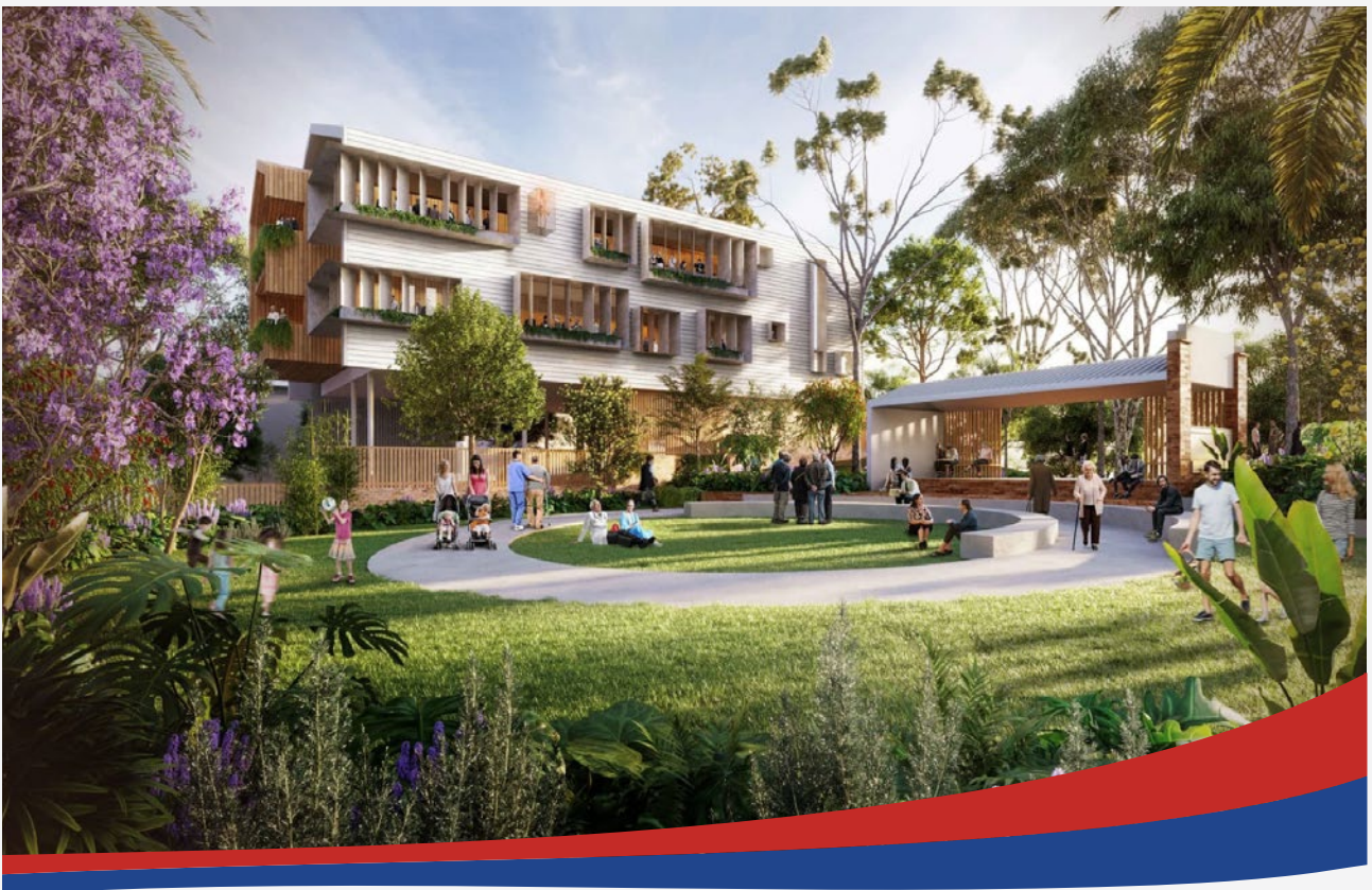
Artist impression of our new Legacy House being built at Greenslopes.

Fear not that you have died for naught The torch you threw to us we caught. And now our hands will hold it high Its glorious light shall never die, We'll not break faith with you who lie On many a field. Lest we forget